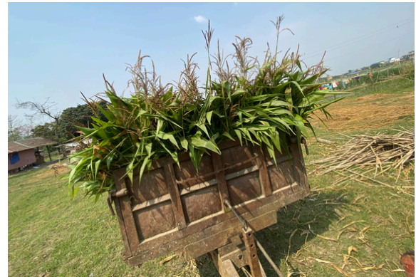
Delivery of Corn, Hay and banana trees April 2025