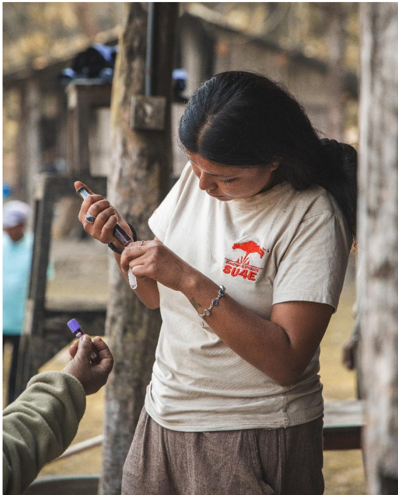
SU4E team during community outreach and field activities — SU4E 2026