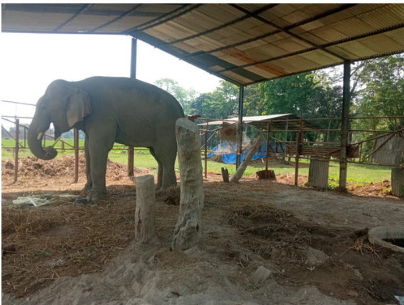
The soil of the stable replaced by new fresh one.

SU4E also provides trailers of fresh, clean soil whenever necessary to replace the soiled ground in Ramu’s stable. This helps maintain a more hygienic and comfortable environment, reducing the risk of infection and supporting better overall health.