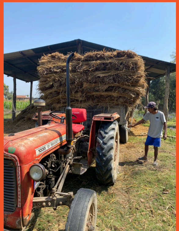
Delivery of food for Ramu