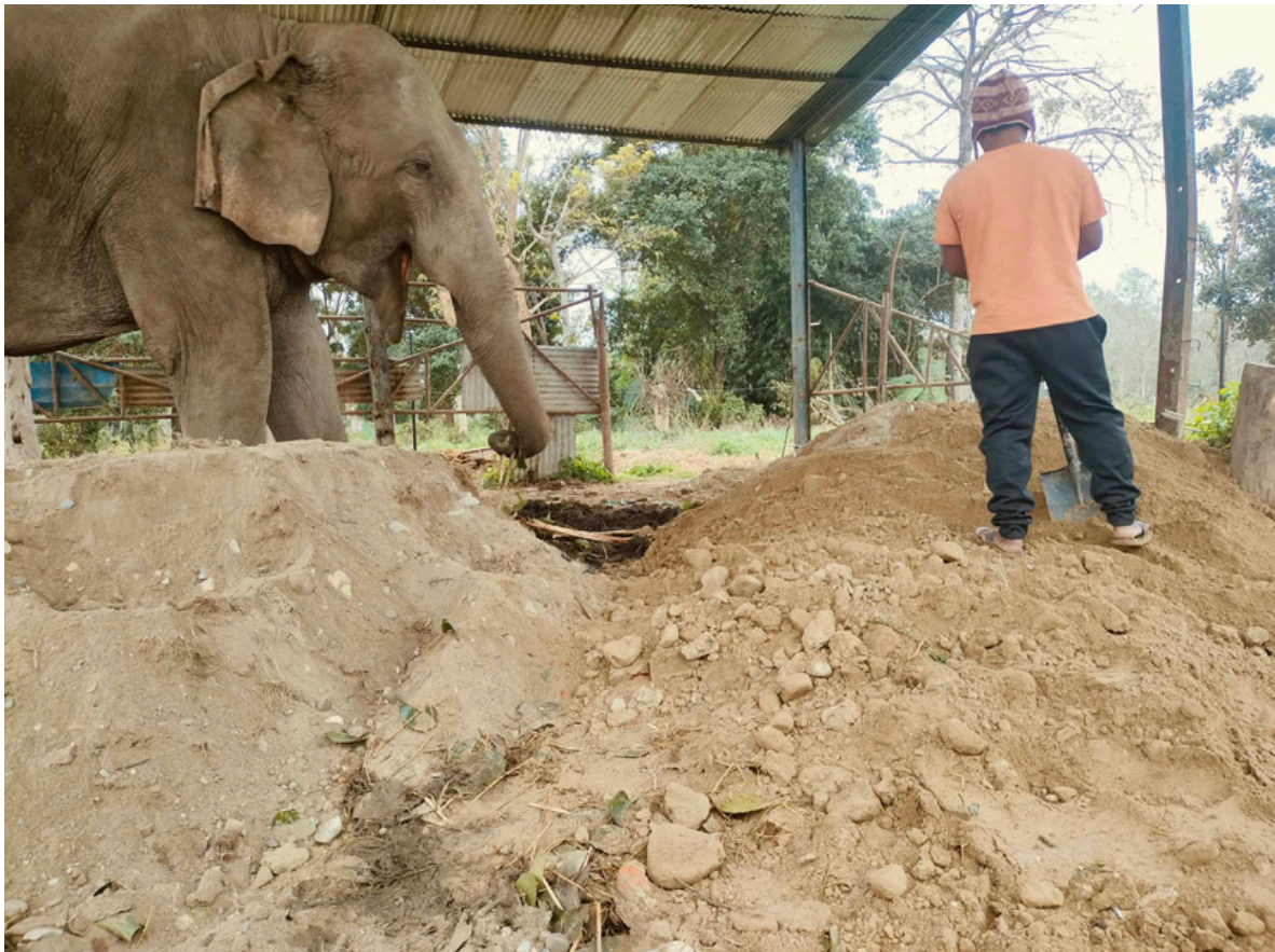
New soil brought for more hygienic substrate