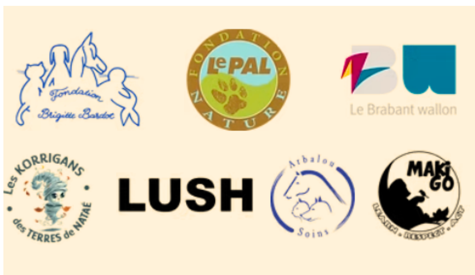
Stand Up 4 Elephants Belgium Partners

The SOS Elephant program continues to run smoothly. SU4E is still providing daily food support for Ramu, a 36-year-old male elephant in Sauraha who has been chained in the same spot for several years. Thanks to a new partnership with The Call to Conserve, a nonprofit working to support elephants and mahouts across Asia, we are now also covering the salary of Ramu's sole mahout—ensuring both elephant and caretaker receive the support they need.