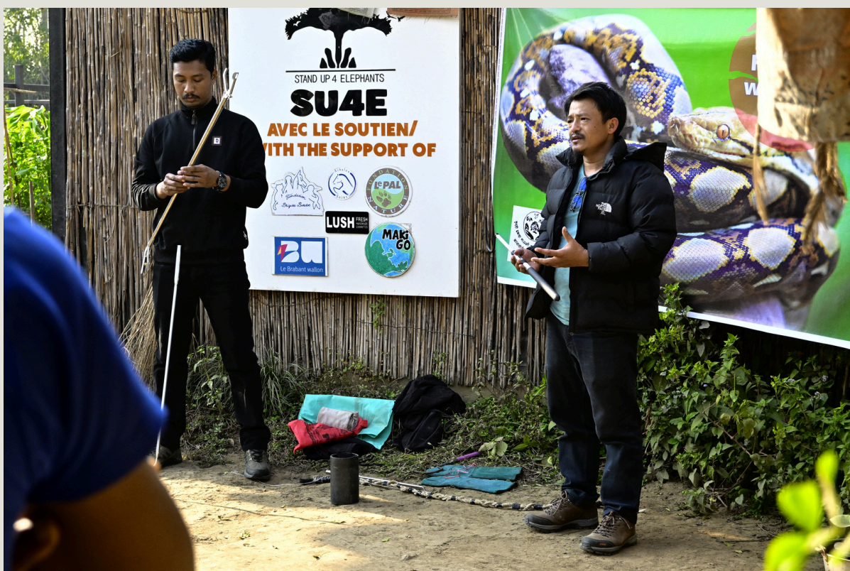
Half Day practice with tools and fak snakes at the SU4E sanctuary

All the participants were shown procedures of handling different tools and things to keep in mind while using them.