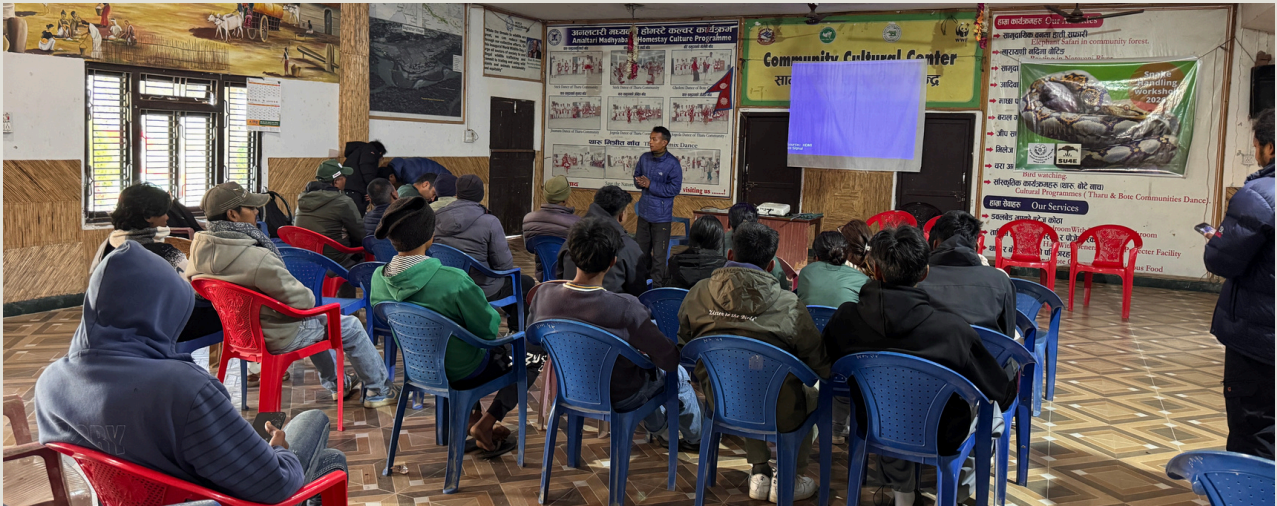
Half day Theory at the Community Center, Amaltari Homestay Village