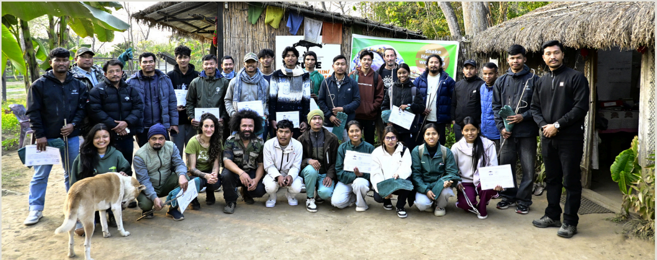
Half day Theory at the Community Center, Amaltari Homestay Village