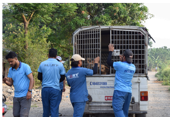
Street Dogs Campaign May 2025